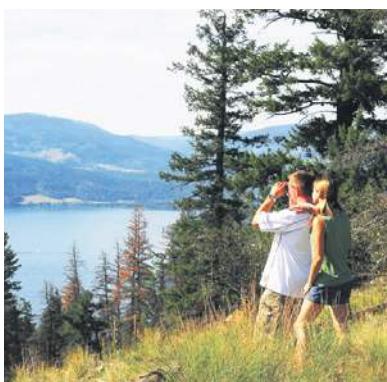
Retirees at Predator Ridge enjoy the company of like-minded people and the comfort and peace of mind that come from living in a safe, well cared for community.

three bedrooms, two of them set up for guests, and they get used regularly. Our relatives and friends want to come see what we've got here."